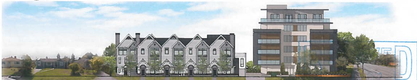
4 CONTEXT ELEVATION