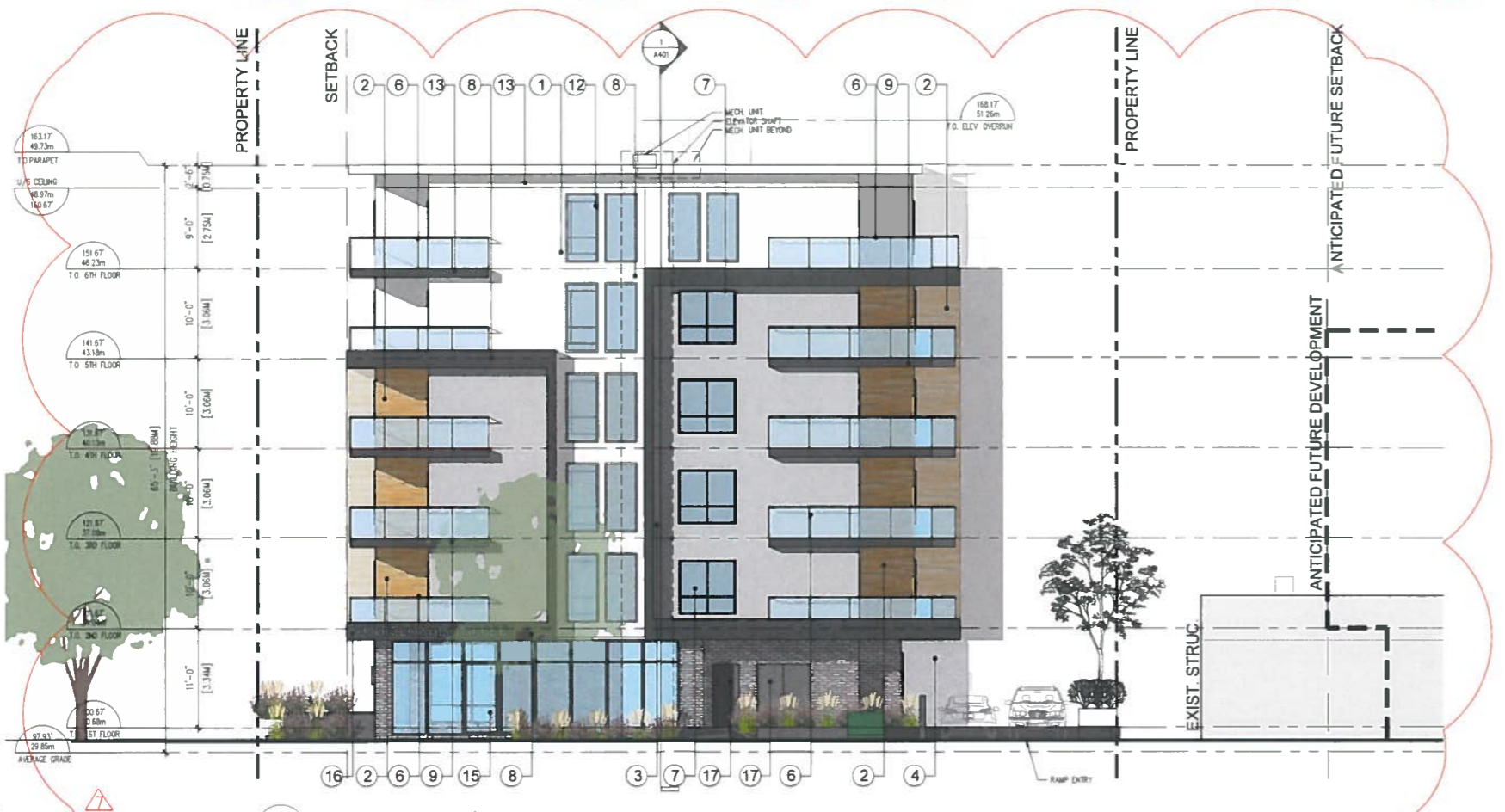
2 NORTH ELEVATION 1:100