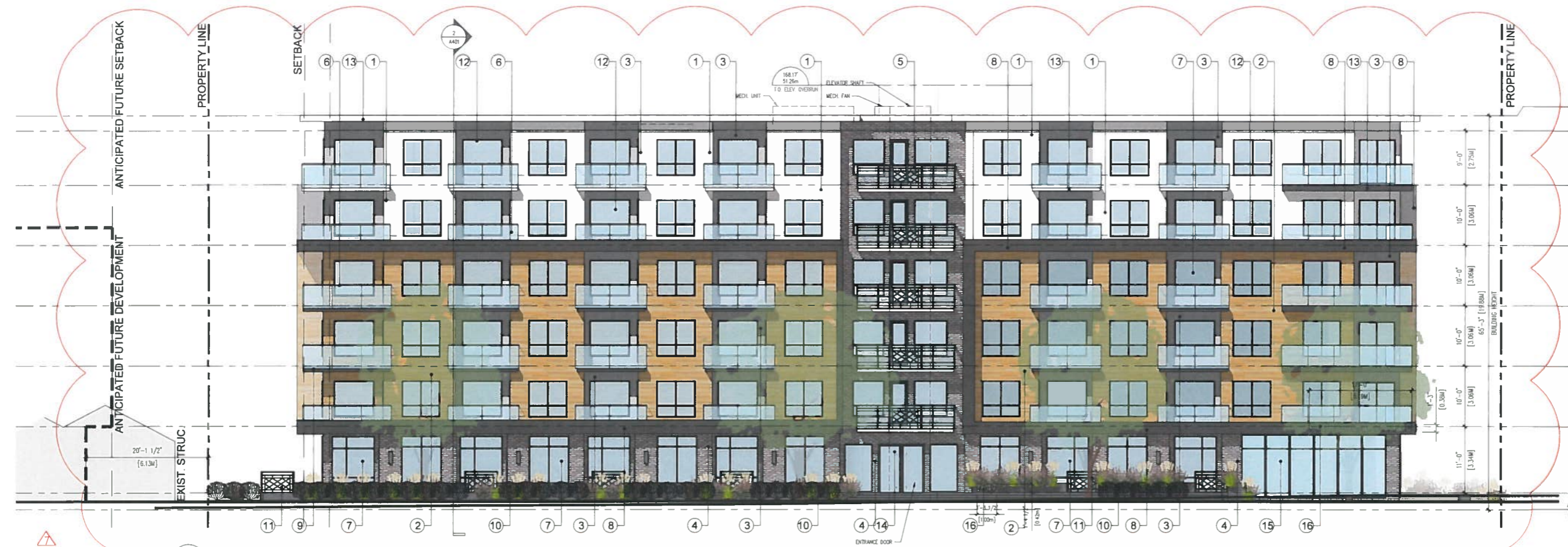
1 EAST ELEVATION 1:100

PROJECT NO 19057 DRAWN BY: XV SCALE 1:100 REVIEW BY: DM DWG NO