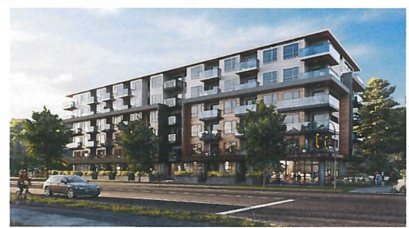
3 PERSPECTIVE RENDERING NTS