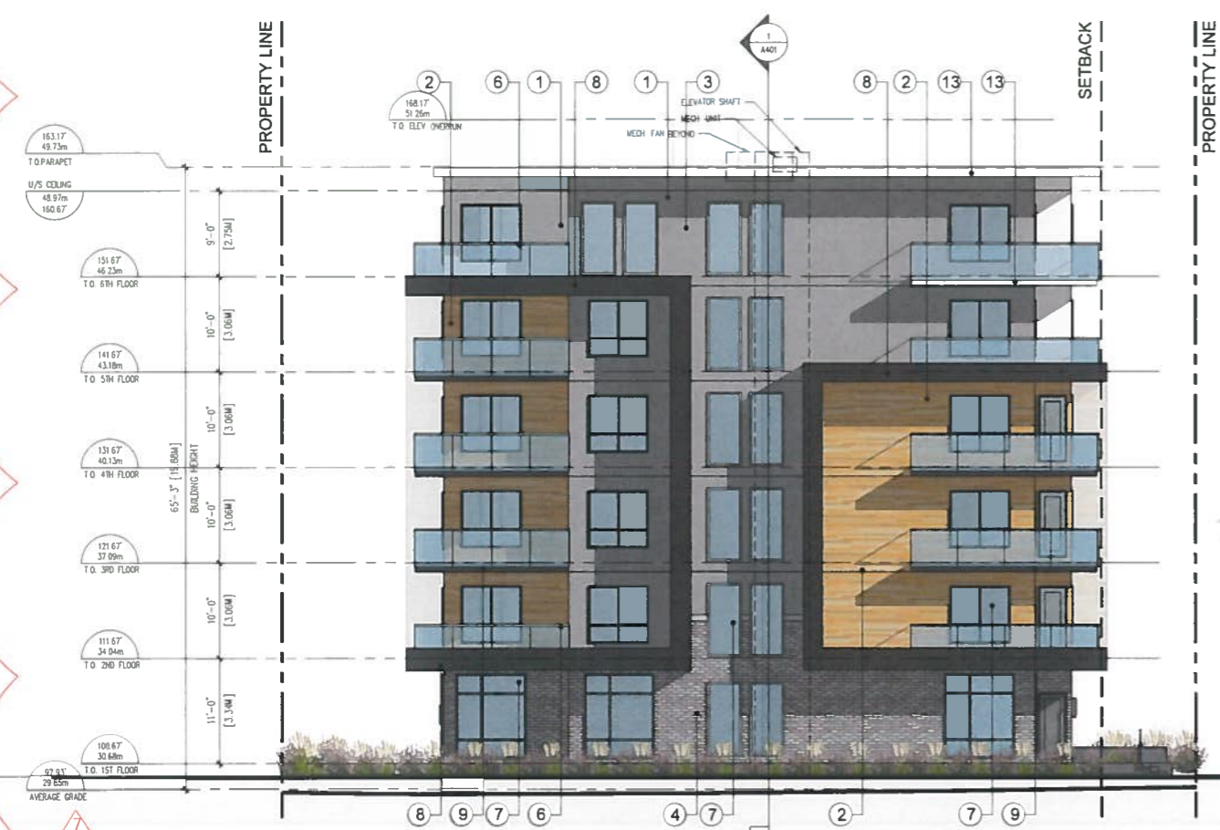
2 SOUTH ELEVATION 1:100