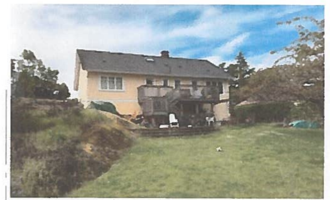
North Side - Existing Residence