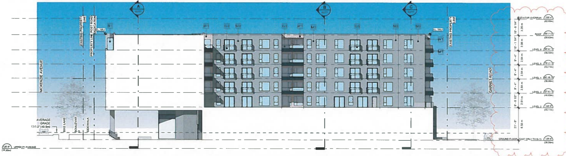
1 EAST (TERRACE EAST) BUILDING ELEVATION - DP SCALE: 1 : 200