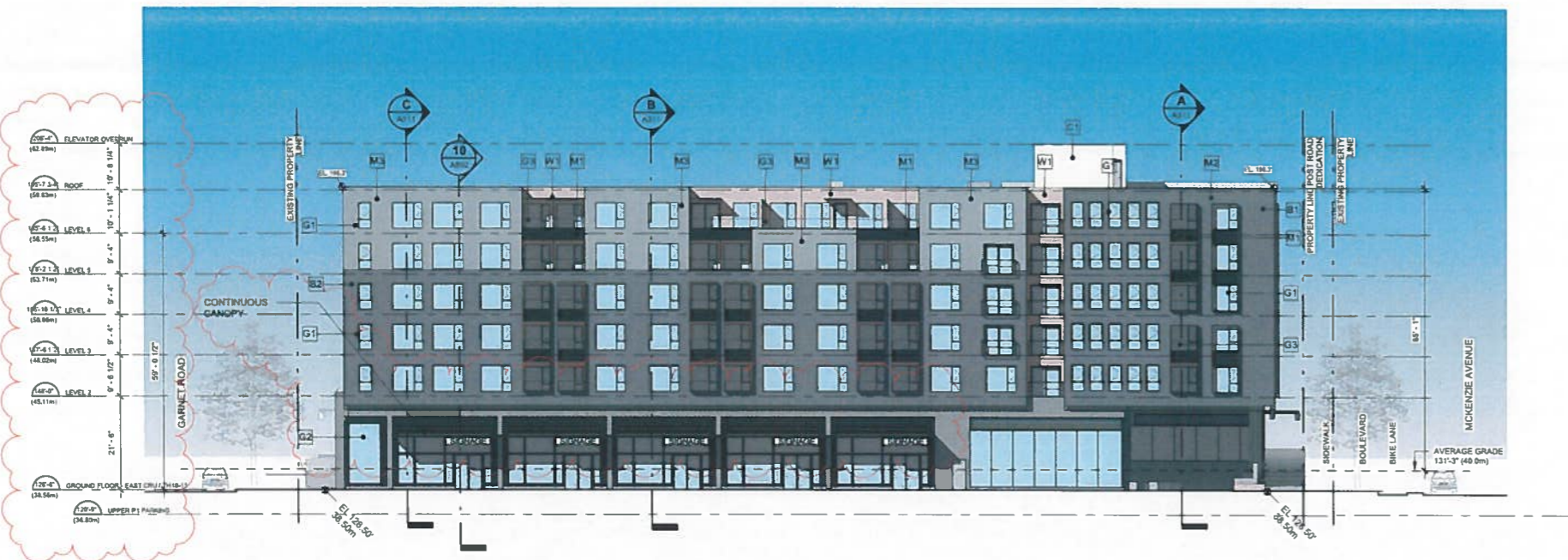
2 EAST ELEVATION - DP SCALE: 1/200