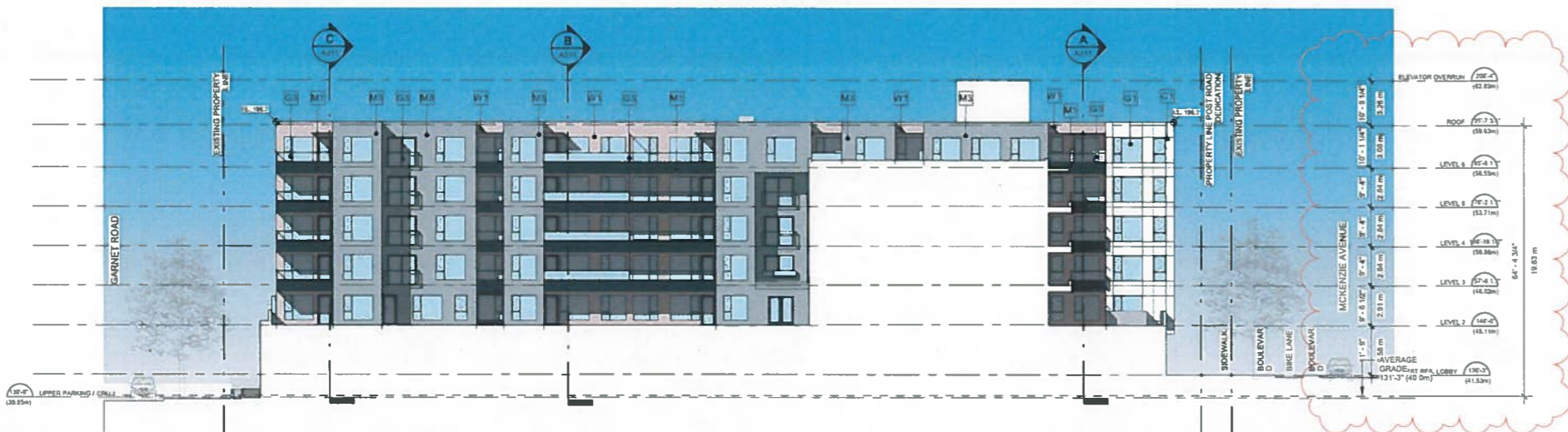
2 WEST (TERRACE WEST) BUILDING ELEVATION - DP SCALE: 1/200