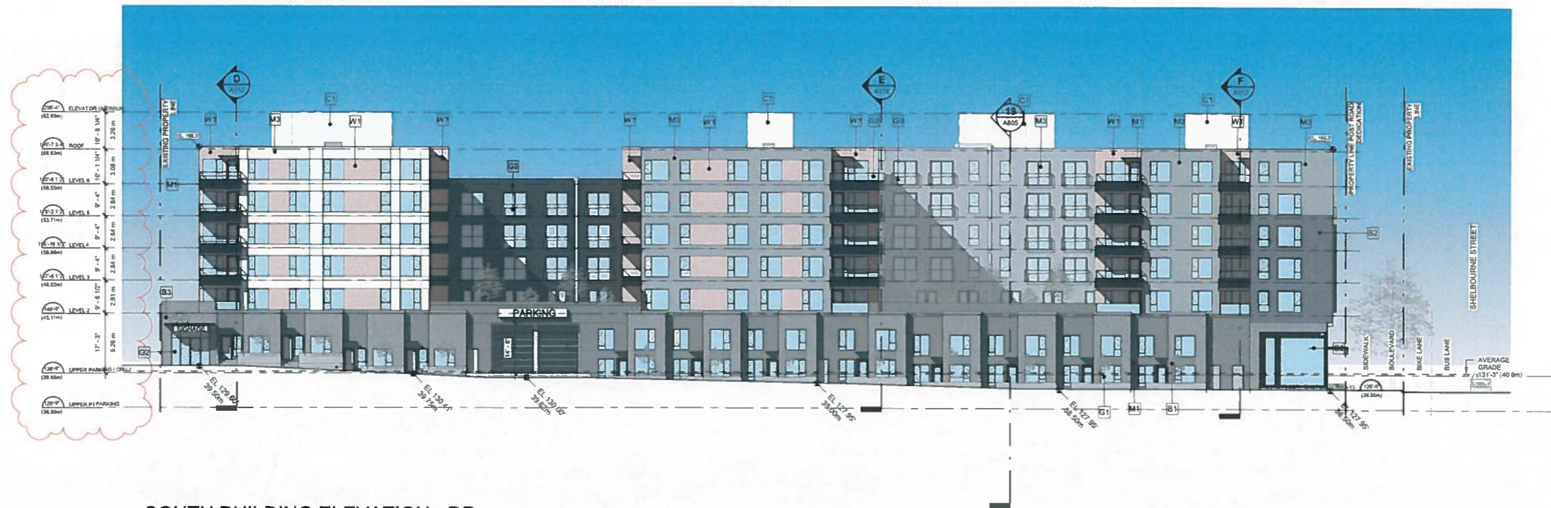
1 SOUTH BUILDING ELEVATION - DP SCALE: 1/200