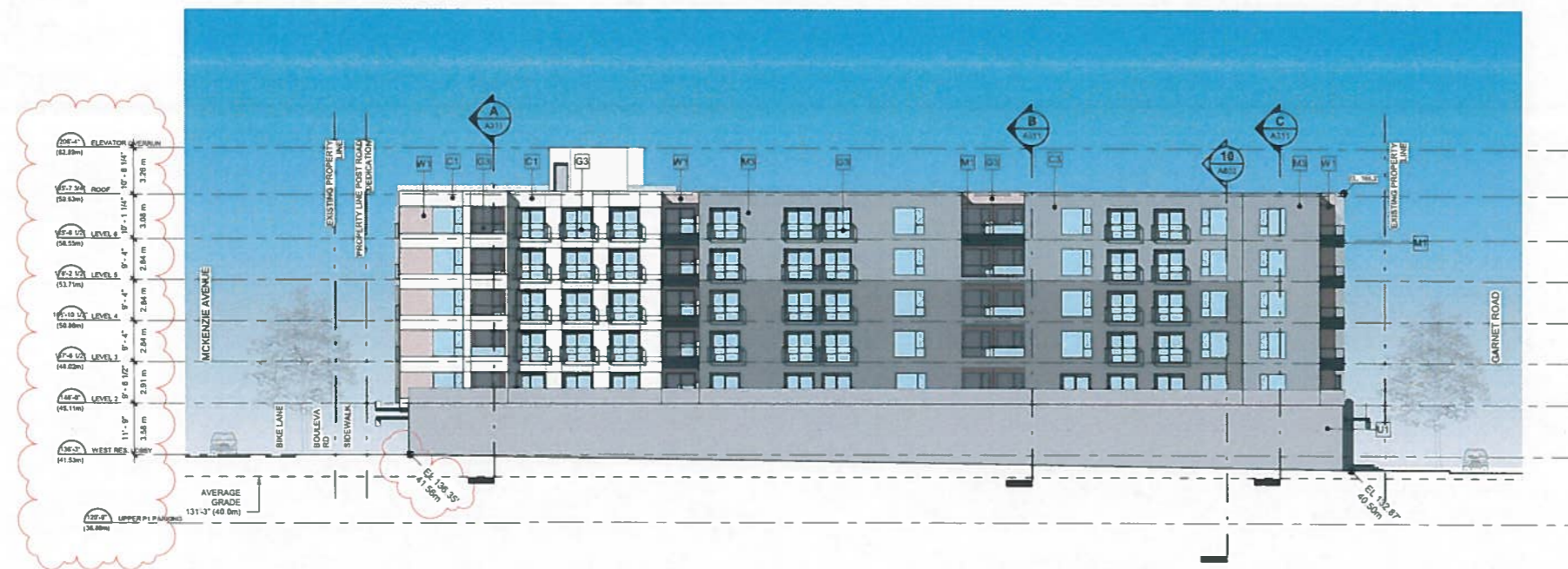
2 WEST BUILDING ELEVATION - DP SCALE: 1/200