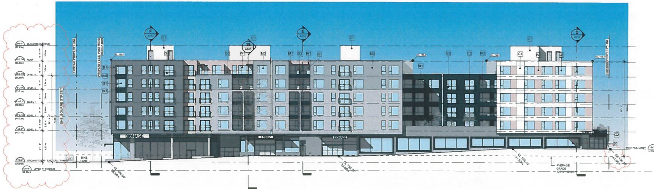
1 NORTH ELEVATION - DP SCALE: 1/200