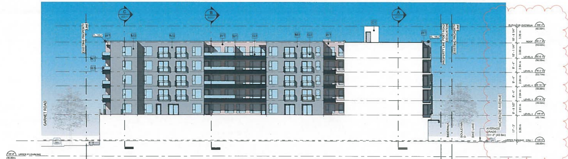
2 WEST (TERRACE EAST) BUILDING ELEVATION - DP SCALE: 1 : 200

RECEIVED JUN 21 2022 PLANNING DEPT. DISTRICT OF SAANICH