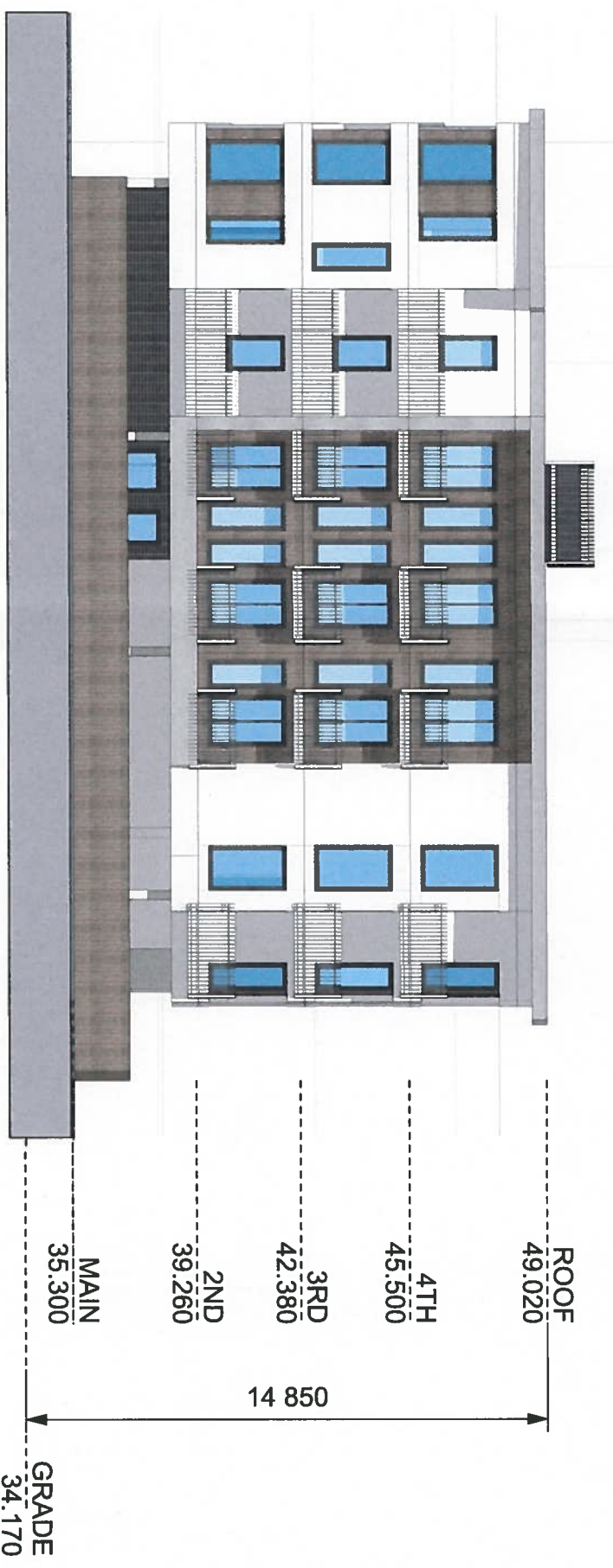
1 Elevation East