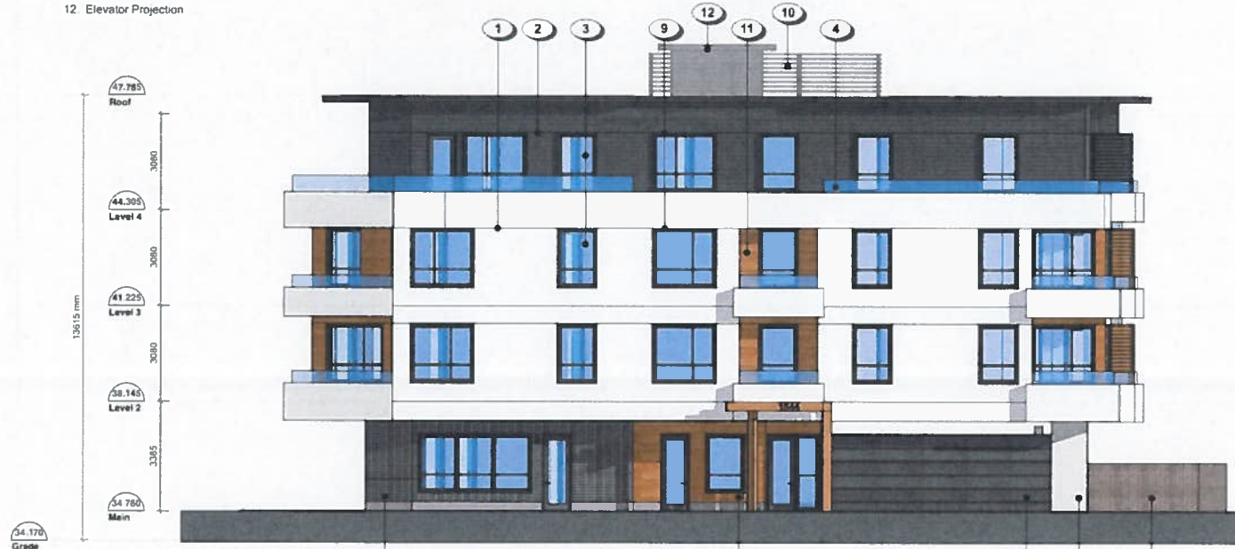
1 SOUTH ELEVATION A3.0 Scale: 1:100