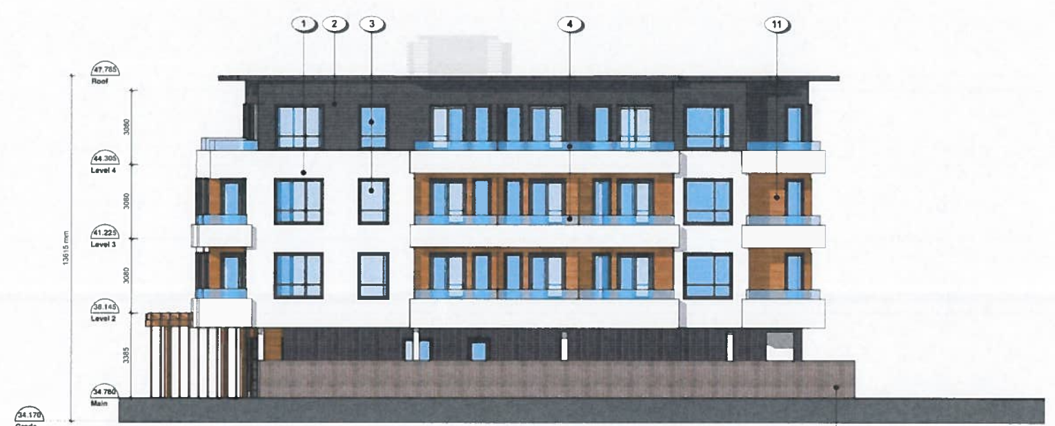
3 EAST ELEVATION A3.0 Scale: 1:100