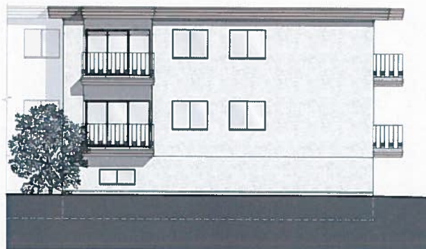
Existing Side Elevation [West] metric scale 1 : 100