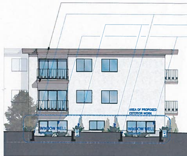
Proposed Side Elevation [West] metric scale 1 : 100