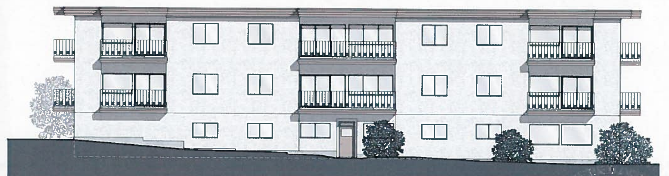
Existing Rear Elevation [South] metric scale 1 : 100

RECEIVED JAN 16 2019 PLANNING DEPT. DISTRICT OF SAANICH