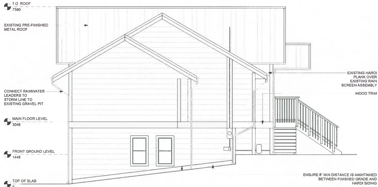
1 EAST ELEVATION A4 1:50