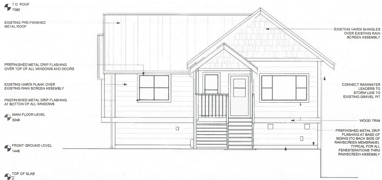
4 NORTH ELEVATION A4 1:50

RECEIVED JUL 14 2022 PLANNING DEPT. DISTRICT OF SAANICH