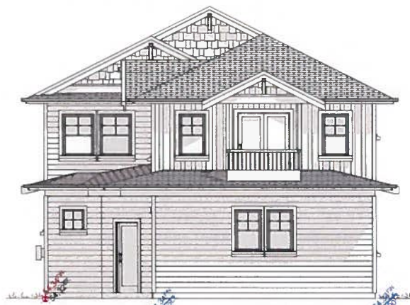
FRONT ELEVATION SCALE 1/8" = 1'-0"