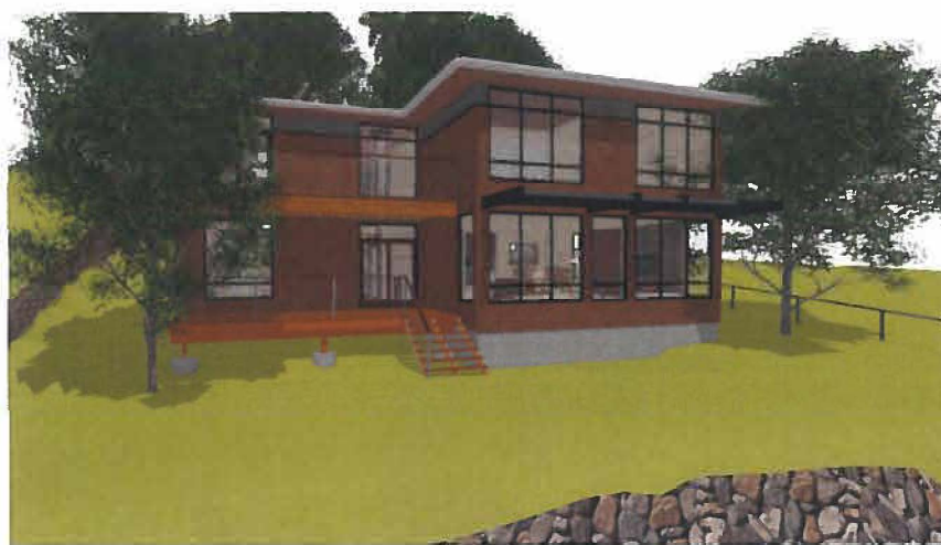
View From the Southwest