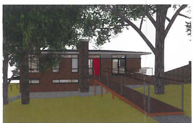
View From the Northeast