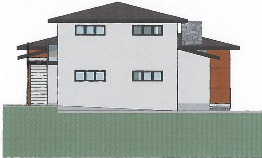
Left Elevation Scale: 1:50