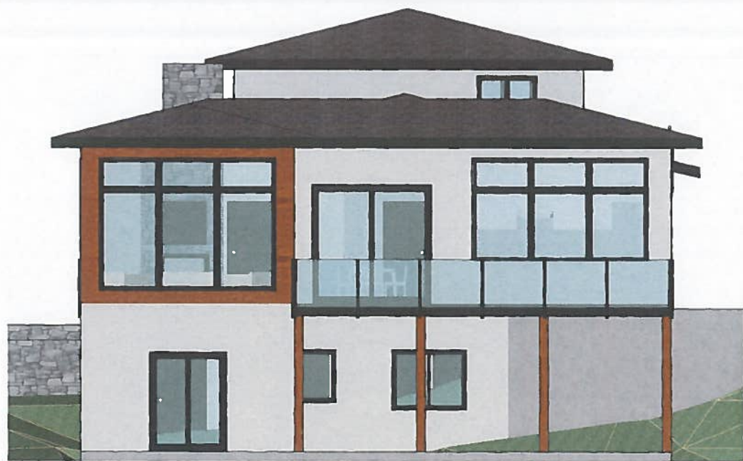
Right Elevation Scale: 1:50