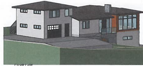
Front Left Scale: 1:50