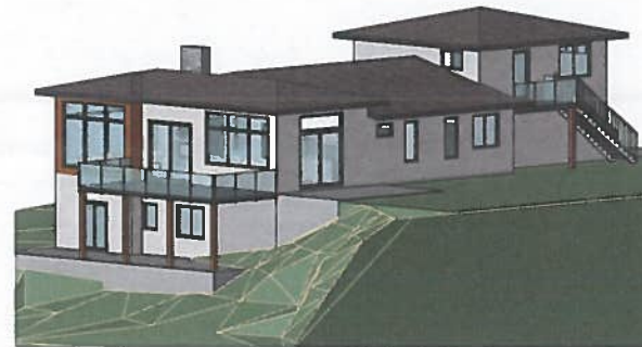
Rear Right Scale: 1:50