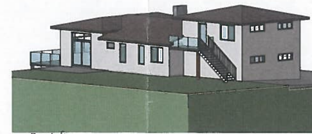
Rear Left Scale: 1:50

RECEIVED MAR 08 2021 PLANNING DEPT. DISTRICT OF SAANICH