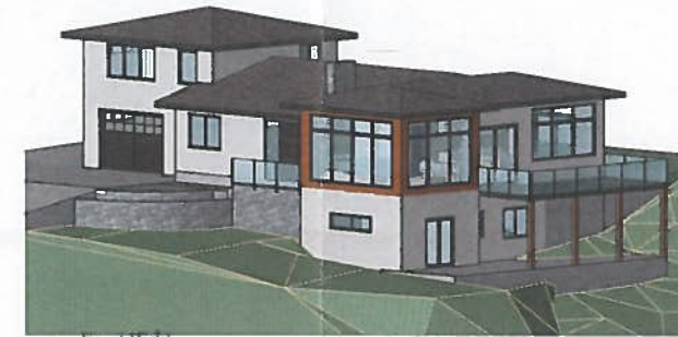
Front Right Scale: 1:50