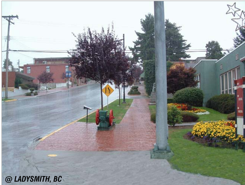
@ LADYSMITH, BC

1. Recent Sidewalk and Landscape Enhancements.