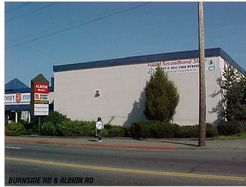
BURNSIDE RD & ALBION RD

1. Recent Sidewalk and Landscape Enhancements.