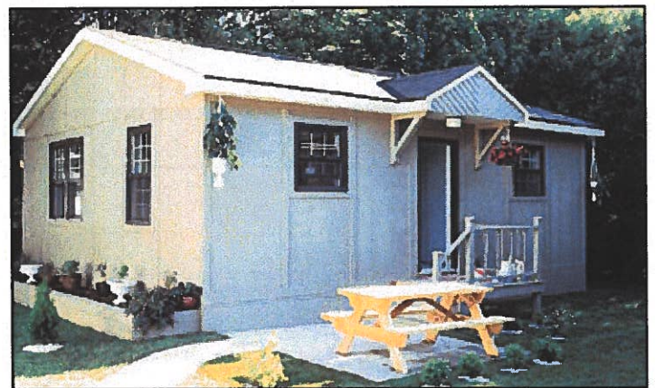
Figure 1: Garden suite

Garden suites are defined as small detached homes (see Figure 1) that are sited in the rear yard of single family lots where an accessory building might go (see Figure 2), and are accessory to the primary dwelling.