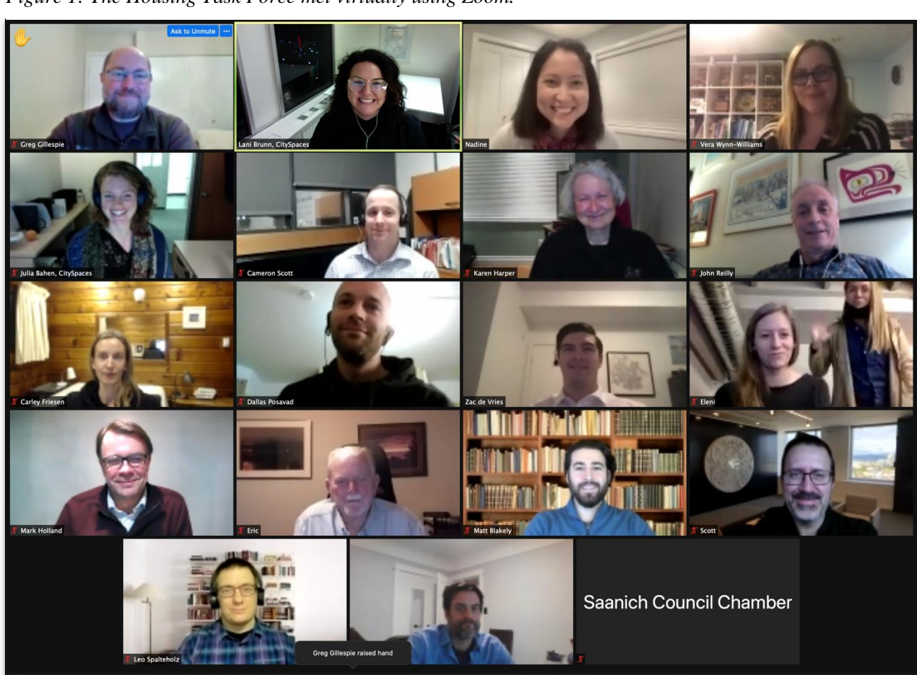
Figure 1: The Housing Task Force met virtually using Zoom.

Given the COVID-19 pandemic, meetings were held virtually using Zoom video conferencing and mural.co, an interactive digital whiteboard service. These tools allowed for collaborative group discussion, as participants were able to contribute directly to smaller brainstorming sessions in break-out rooms.