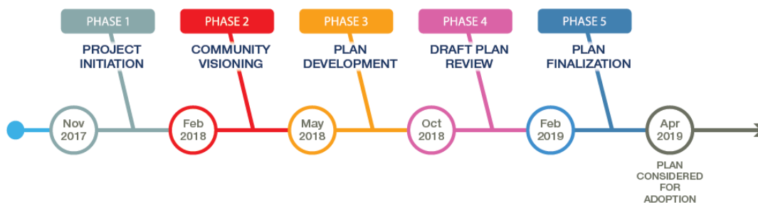
Figure 4: Project Timeline

The local area plan update is anticipated to take 18 months. Figure 4 provides an overview of the process, while Table 1 outlines the planning process showing project phases, key activities and deliverables. While project activities are fairly well defined, there exists some ability to adapt public engagement activities based on the feedback of the Project Advisory Committee and other community stakeholders, provided it meets overall project timelines and objectives.