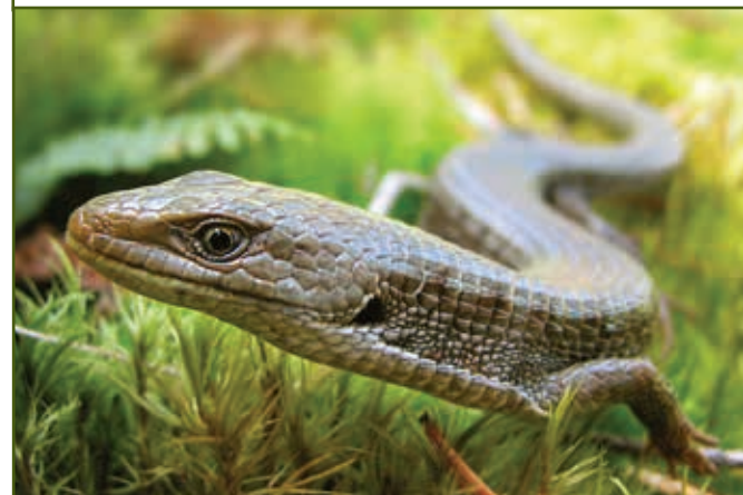
Northern Alligator Lizard