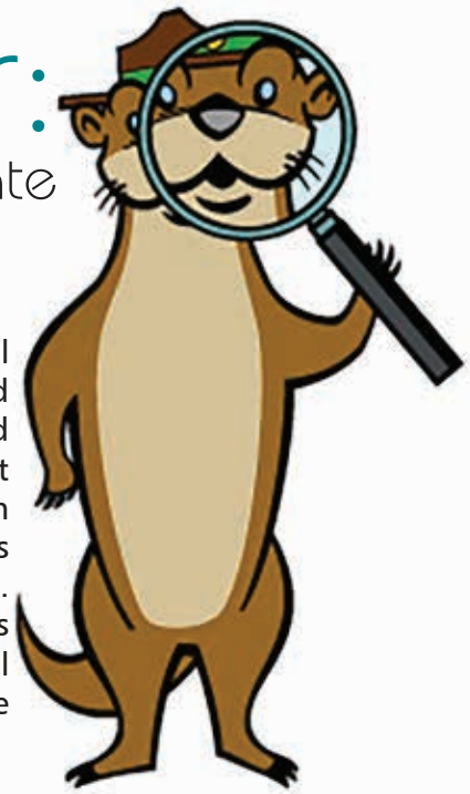
Ollie the Otter CRD Watershed Warden

This past spring, the CRD's Integrated Watershed Management Program hosted a rural workshop with Peninsula Steams Society and Hatchet and Seed. The workshop explored innovative integrated water management (IWM) practices for broad-acreage and looked at techniques for recharging groundwater and decreasing surface contaminant runoff into our rural waterways and marine environment. The workshop focused on using Keyline Design, a permaculture technique that works with the natural contours of the land to capture rainwater and direct runoff into areas for storage or infiltration. Stormwater runoff occurs when precipitation travelling over the land and impervious surfaces picks up contaminants and carries them to the local waterways. Runoff in rural areas can carry manure, fertilizers, and pesticides which harm our creeks, lakes, and the marine environment.