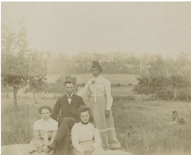
Glendinning Farm

A smaller display has been set up outside the Council Chambers at the Saanich Municipal Hall. View photographs of mayors and council members of days gone by.