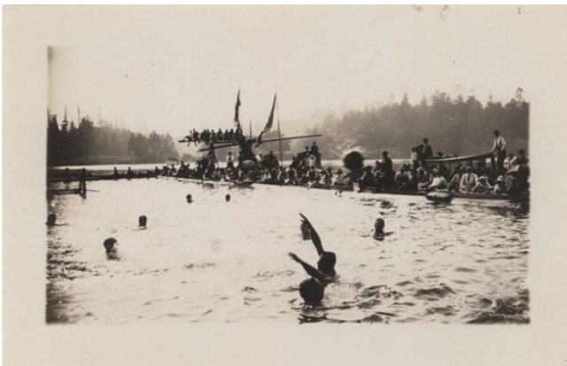
[Victoria and Island Athletic Association], Curtis Point, the Gorge, ca 1920 (2009-004-004)