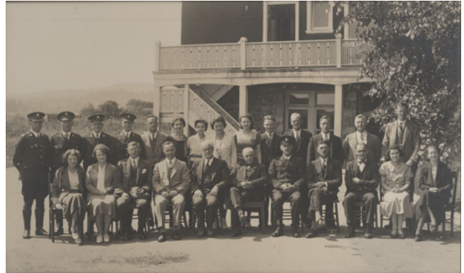
Council and staff in front of Municipal Hall on West Saanich Road, 1930s (2009-020-017)

Archives staff are always working to make our records more accessible, and to make the public aware of what is available in our archival holdings. The following are records that have recently been processed and are available for viewing in the reference room: