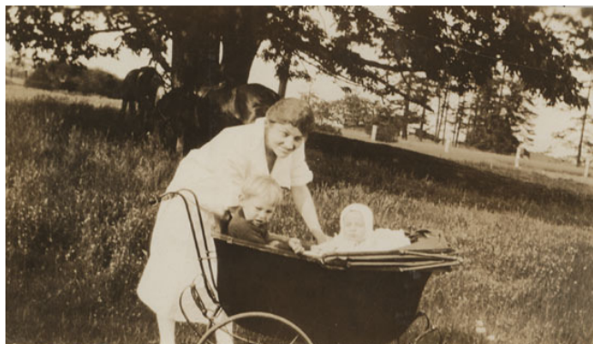
Unidentified woman with children in a buggy (2007-097-014)