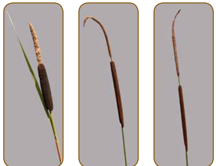
This composite photo shows from left to right, the native Typha latifolia , the hybrid T. x glauca , and the introduced Typha angustifolia .

We thank the volunteers who helped us this year and we hope to see you next year. The success of our program and the health of the marsh at Rithet's Bog depend on your help.