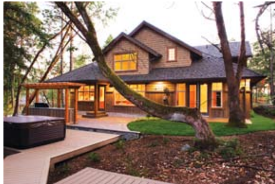
Oceanwood Built Green™ development, Saanich