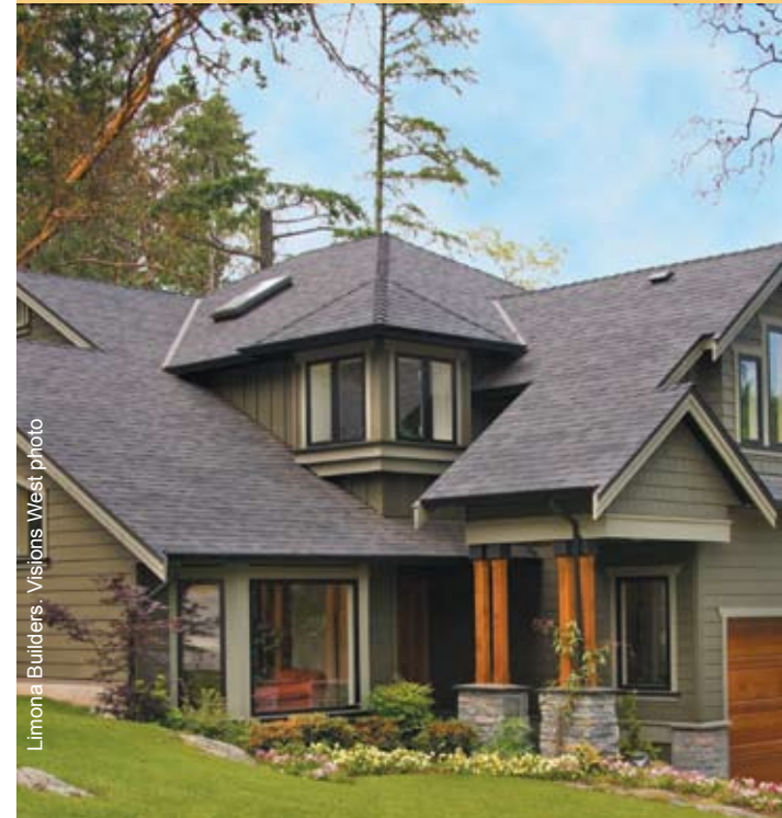
Limona Builders