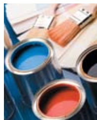
Low VOC paint