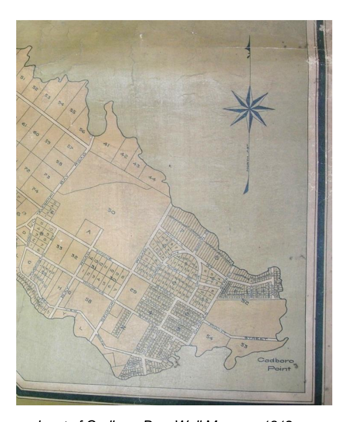
Inset of Cadboro Bay, Wall Map, ca. 1912

This collection includes approximately 3,500 plans, 1906-1980, including residential and commercial structures, sketch plans of proposed additions and outbuildings, subdivisions, and public works proposals. This collection is not exhaustive and does not include all structures in Saanich. The Saanich Planning Department, Inspections Division, also has some building plans. They may be reached by phone at 250-475-1775 Extension 5457.