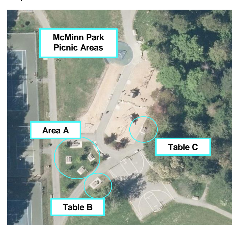
Table C: This is one (1) table and can seat 6 comfortably. Located beside the playground.

Google map link: https://goo.gl/maps/oAcNgj8NTdx