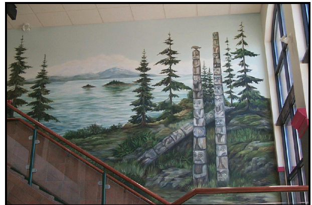
Mural inside Saanich Road McDonald's

Procedure for Encouraging Private Sector Public Art. Through the development application process, a private developer or the applicant will be informed of the District's Public Art Program. As an incentive to encourage public art on private developments, the District will provide the jury process as outlined in Section 7.2, if a developer wishes to use it. As well, recognition of cash donations will occur through a plaque inscription program.