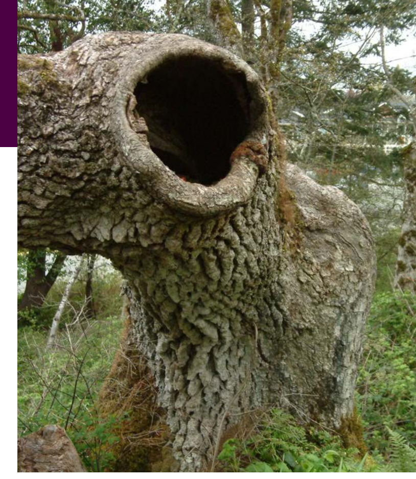
Natural Garry Oak tree cavity

Wildlife tree habitat and the species that use them are part of the complex ecological web around us and that includes us. Humans are part of this web of life, including benefiting from ecosystem "services" such as those connected with wildlife trees: control of pests and pathogens, nutrient cycling, soil health, biodiversity and more.