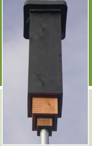
Rocket style bat box

Once you have considered essential habitat elements in your naturescape such as healthy soil, native plants, water, wildlife trees, layers and edges of trees and plants, you can also consider "enhancements" to support different types of wildlife. Below are some ideas, but you can find more throughout this guide and in our resource section at the end. On pages 12-14 you will find ideas for enhancing your yard for birds, followed by ideas for pollinators and butterflies on pages 15-18.