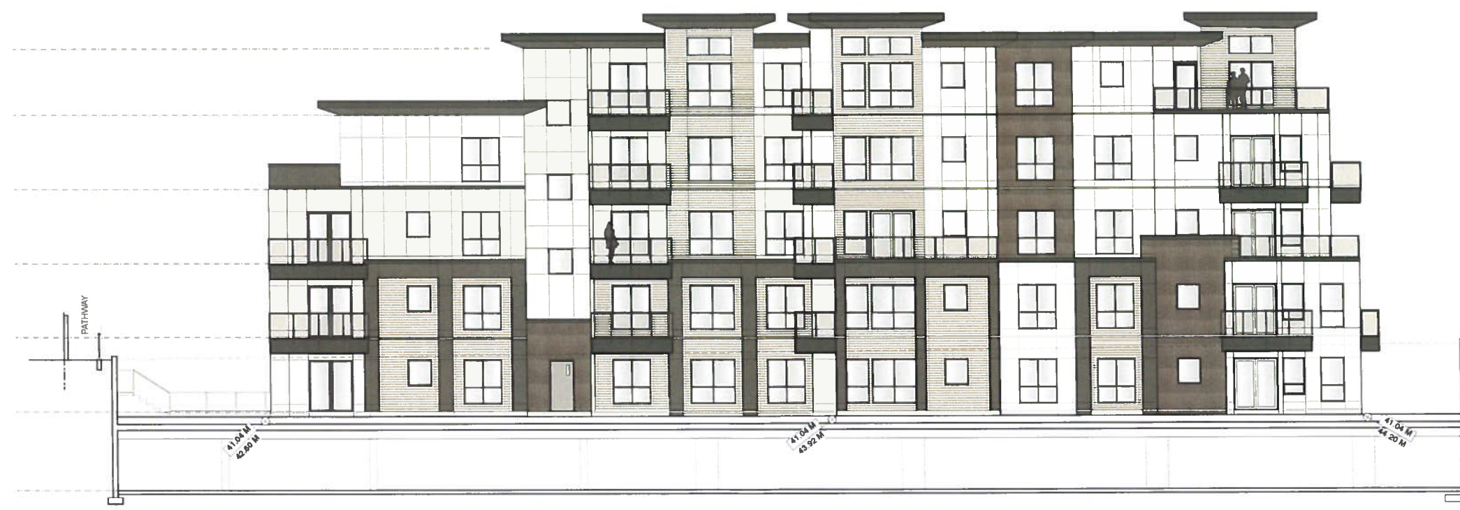
2 WEST ELEVATION A-301 Scale: 1/8" = 1'-0"