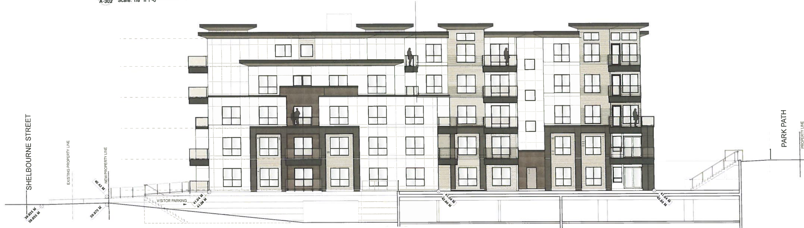
2 NORTH ELEVATION A-302 Scale: 1/8" = 1'-0"