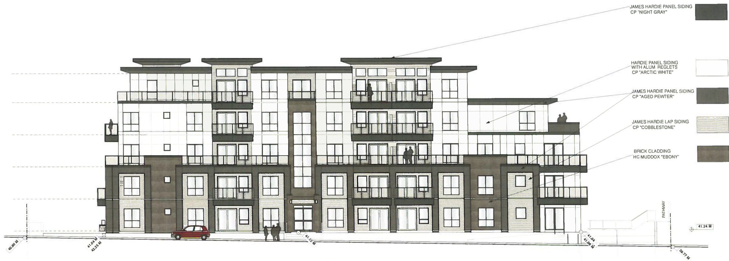
1 EAST ELEVATION A-301 Scale: 1/8" = 1'-0"