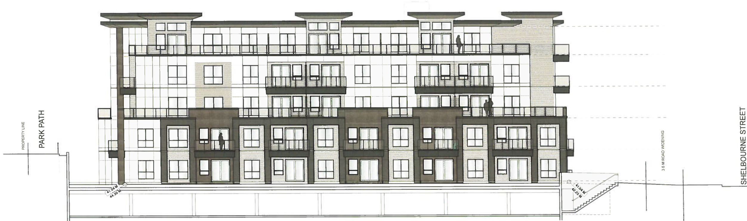
1 SOUTH ELEVATION A-302 Scale: 1/8" = 1'-0"