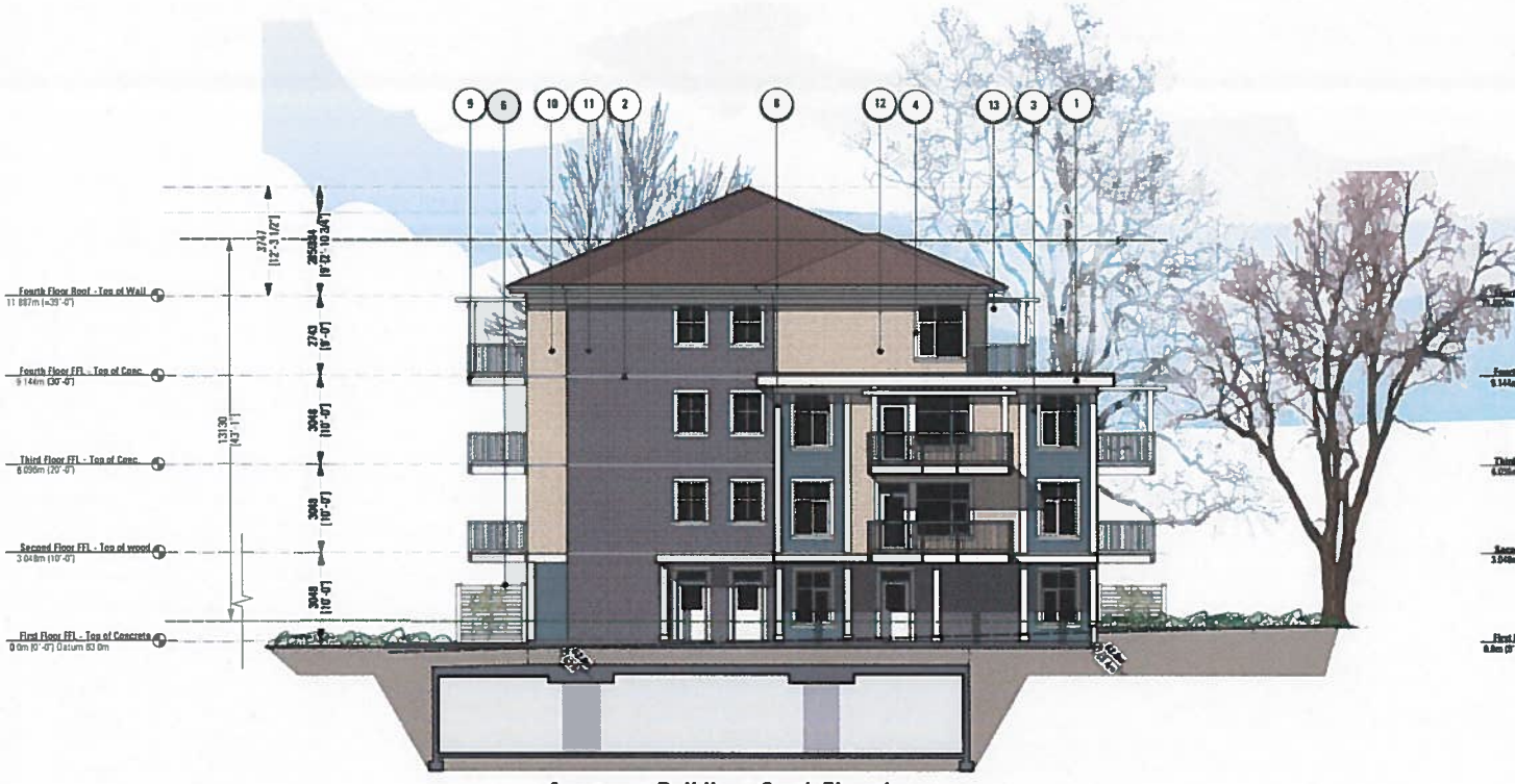
Apartment Building - South Elevation Scale: 1:125m