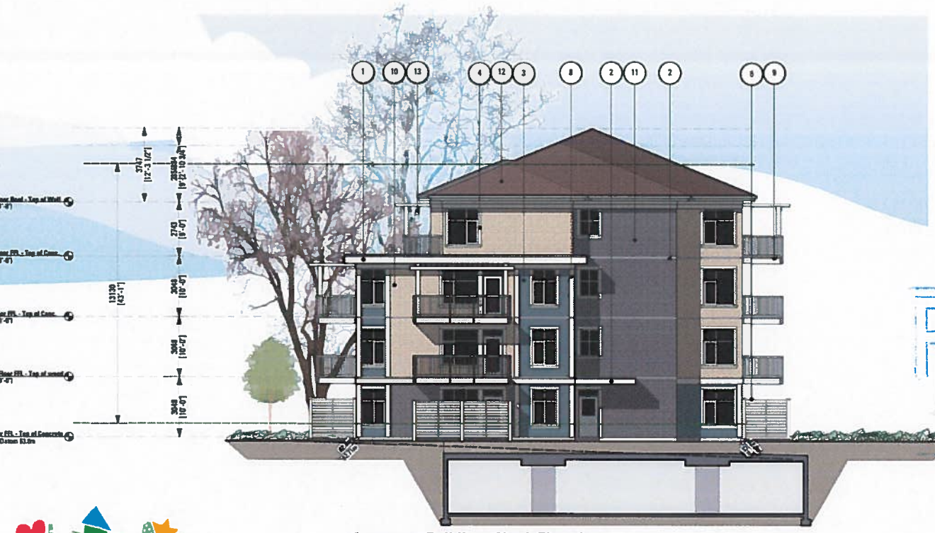
Apartment Building - North Elevation Scale: 1:125m

RECEIVED JUN 02 2020 PLANNING DEPT. DISTRICT OF SAANICH