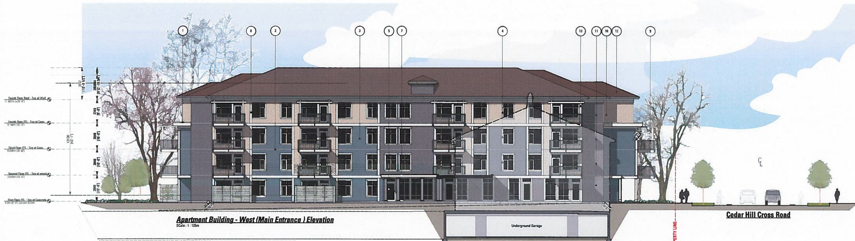
Apartment Building - West (Main Entrance) Elevation Scale: 1:125m