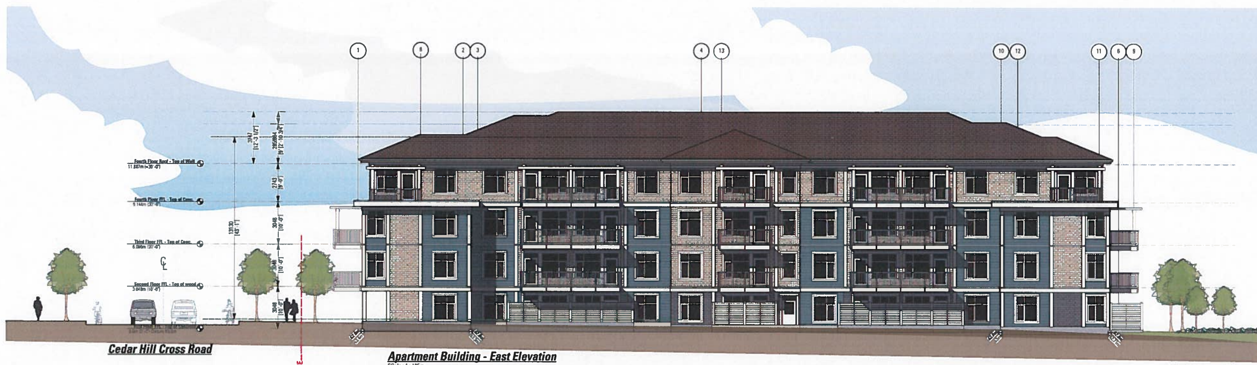
Cedar Hill Cross Road