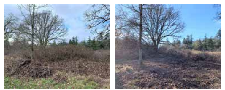
Photos: 'Before' and 'after' invasive removals, during restoration work

Off-site, at the Saanich Parks nursery, Saanich's Natural Areas staff have been busy collecting seed from various species at Layritz, and propagating them to then plant back into the woodland. By collecting the seed from plants already at the site, staff help maintain the genetic diversity of the area and propogate plants that we know are well adapted to that environment. So far, twenty-four different species have been sown and await planting in the spring and fall.