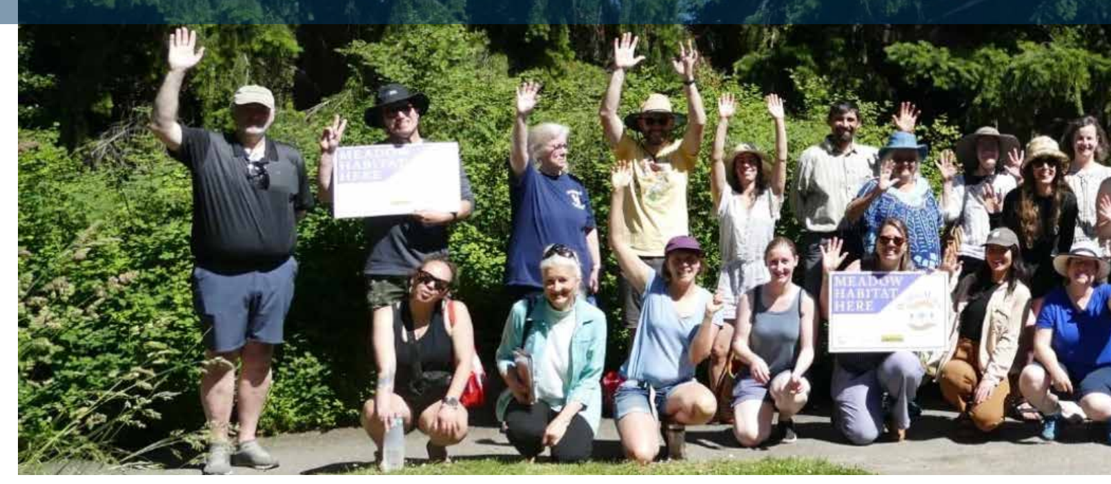
By: Lora Morandin and Kristen Miskelly

After great success in 2022, the MeadowMakers program is continuing into its second year. MeadowMakers is a partnership project between Satinflower Nurseries: Native Plants, Seeds & Consulting and Pollinator Partnership Canada. It is designed to help people restore areas to native plant meadows and pollinator havens. Native plants are fundamental in ecosystem health and conserving local genetics, making them the backbone of ecological restoration. By transforming biologically degraded areas - like lawns - into biodiverse patches, habitat can be created that supports wildlife. Collectively, these areas form corridors that support local wildlife, including pollinators, Gillian, a 2022 Meadowmaker, said "I never dreamt I would be able to create a meadow on this scale." MeadowMakers are making a true impact on ecosystem health within our community!