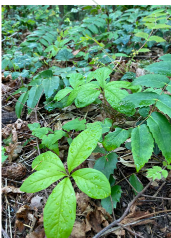
Before and after ivy removal in Haro Woods