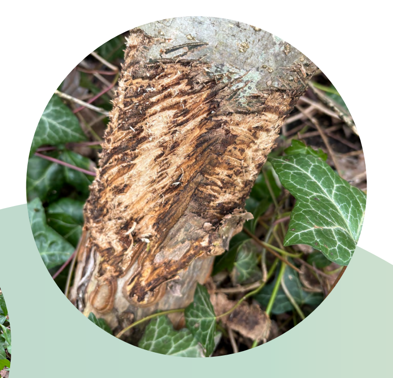
Examples of two tree girdling techniques using a bow saw

We are making steady progress. Many thanks to volunteers, park stewards, and Saanich Parks staff.