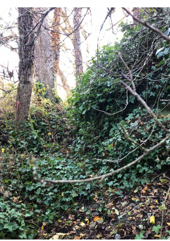
Left: Shiny Geranium; Right: Ivy carpet at Bruce Hutchison Park