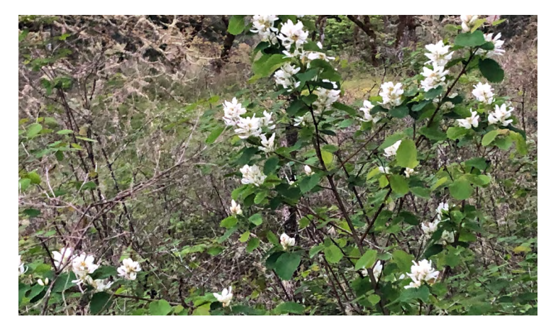
Lewis's Mock Orange

Gardening with native species is also an important part of Naturescaping in Saanich. By planting native species, you are helping to create wildlife habitat and provide wildlife food while supporting biodiversity and mitigating the effects of climate change! This makes you a Naturescaping hero and part of the District of Saanich's commitment to the United Nations Decade on Ecosystem Restoration; calling on everyone to revive damaged ecosystems and address biodiversity loss.