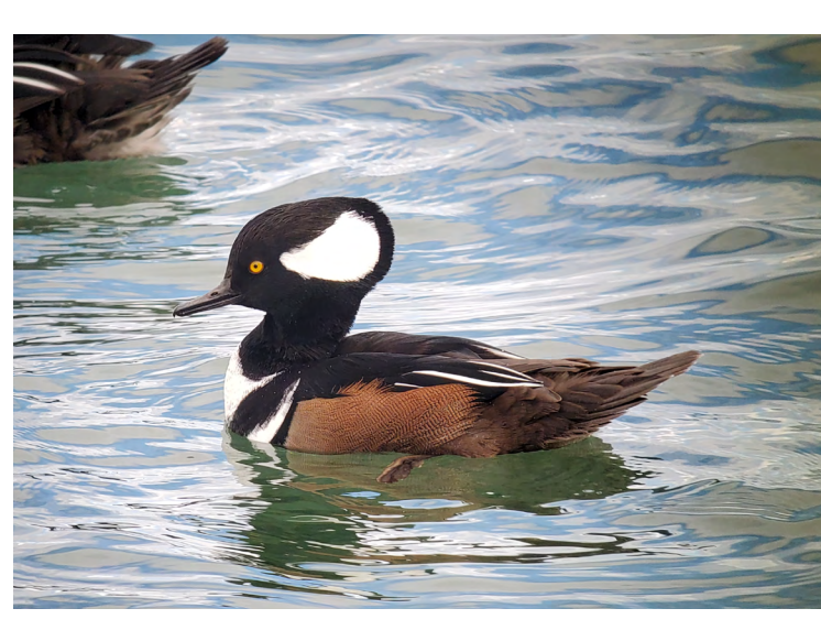
Male Hooded Merganser

For a complete list of activities, visit: